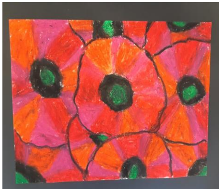
This artwork was produced by Ava for Remembrance Day.

Please make sure you have access to the Skool loop App for any updates.